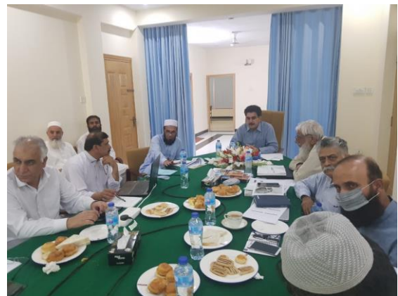
Figure 5.1: Secretary, Agriculture chairing the progress review meeting.

However, it was stated by the Secretary, Agriculture that the Government wishes to check the impact of the interventions of NPIWC-II year wise and such surveys would be started as early as possible.