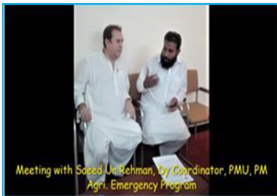
Figure 5.4: Social & Gender Specialist in Meeting with Deputy Coordinator

Deputy Coordinator promised to extend all the possible supports to consultants for the effective ME&IE of the WCBA-KP Project.